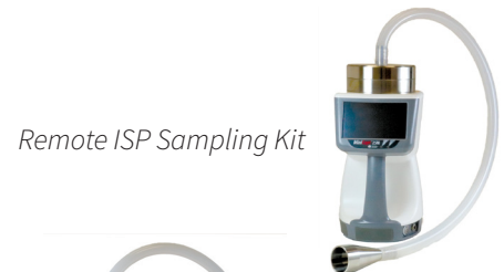
Remote ISP Sampling Kit