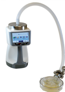
Remote connection to BioCapt® Single-Use