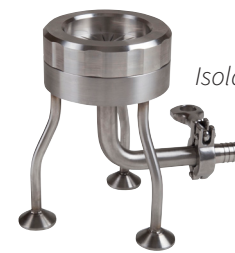
Isolator Monitoring Kit